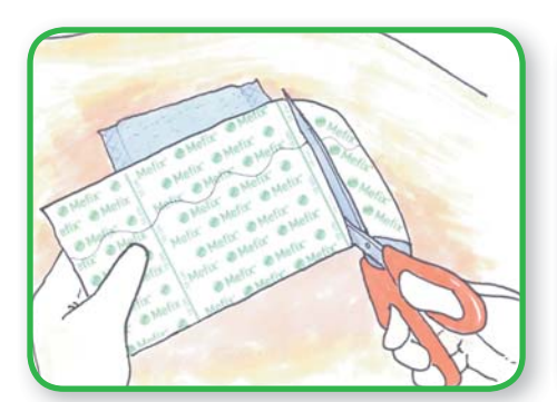
Cut to appropriate size.