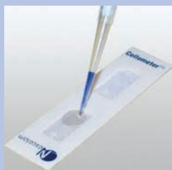
Pipette 20 µl of Sample