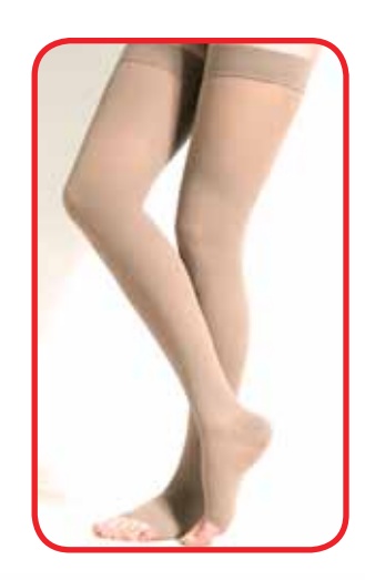
Thigh Length Medical Compression Stocking with Open Toe