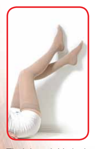
Thigh Length Medical Compression Stocking with Closed Toe