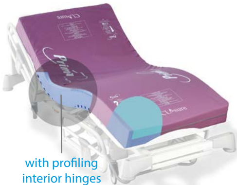
with profiling interior hinges