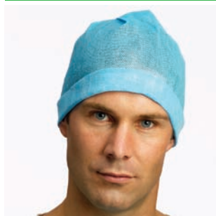
Surgical Cap, Eurocap