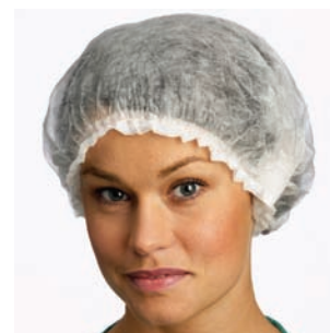
Bouffant Cap, Charlotte

• 621500, 621715, 621725, 621735, 621825, 621835, 621845, 621925