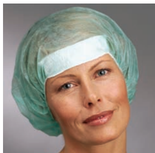
Bouffant Cap, Annie, sweat band