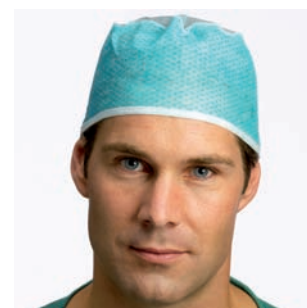
Surgical Cap • 4245