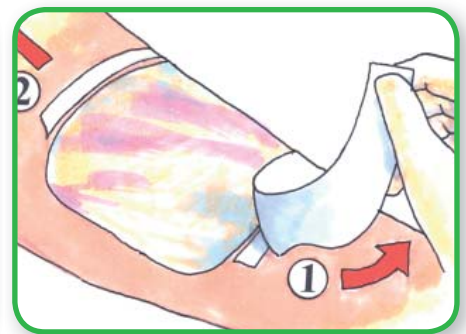
3. Position the dressing and firmly smooth it onto the skin. Remove the paper frame. Remove the two white paper side tabs. Do not stretch the dressing when applying.