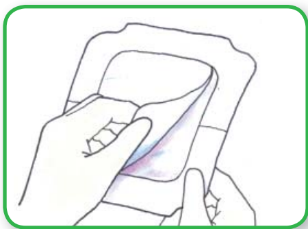
1. For the size 10 x 25 cm and 15 x 20 cm only: Remove center cut out paper and discard.