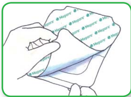
2. Remove the protection foil (printed Mepore) to expose the adhesive.