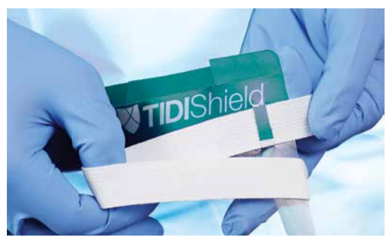
Adjustable Head Strap for Secure Fit