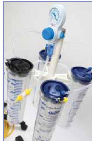
Cascade Stand detail

Determination of antibacterial activity using modified ISO22196 Certificate Number -MSSL-LRN-1017863.1A-ISO-22196 Certificate Number -MSSL-LRN-1017863.1B-ISO-22196