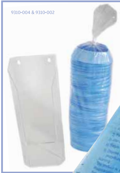
9310-004 & 9310-002