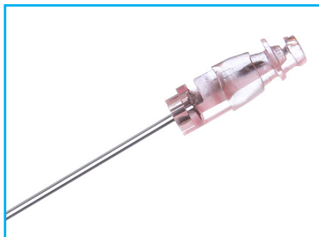
Needle safety guard