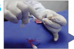
Withdraw the needle slightly and place it back to the original place, to ensure smooth functioning