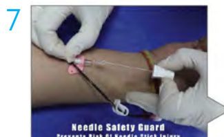
While removing needle, safety guard activates passively, helping minimise accidental needle stick injuries