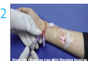
Clear extension tubing, using a pre-filled saline syringe and secure extension tubing securely onto patient hand