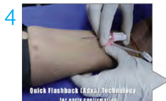
Quick flashback observed in the catheter itself, advance it further into the vein. Helps in minimising the chances of multiple venipuncture and in accessing difficult veins