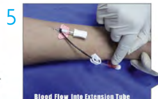
Secondary flash back in extension tubing