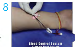
Blood control mechanism helps in preventing blood spillage during procedure