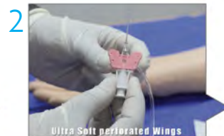
Ultra-soft, large perforated wings provide a better stabilisation platform, which minimises catheter dislocation