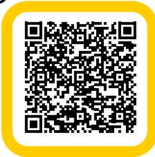
Clinical Study Booklet