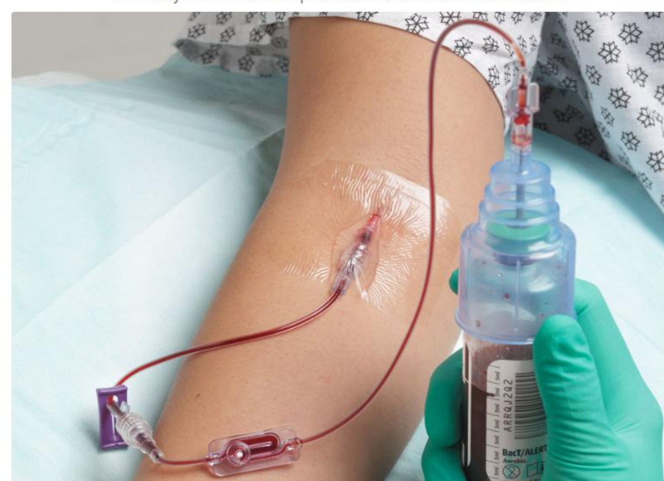
Figure 1: Kurin Lock ® device - can be used both for venipuncture and freshly placed peripheral IV catheter blood culture collection